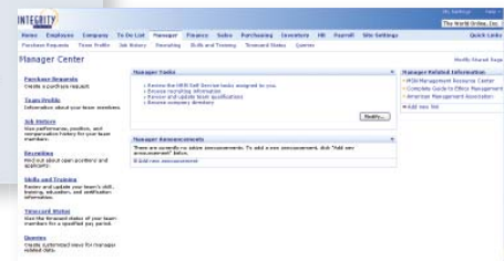
Rely on the powerful functionality and connectivity of Microsoft Business Portal.

Microsoft Dynamics GP provides the ERP functionality to coordinate calculation of payroll tasks automatically, even when employees work in different departments and at different rates during the same pay period. By making it easier to track applicant and employee information, Microsoft Dynamics GP can help healthcare organizations recruit and retain talented employees. In addition, self-service human resources capabilities reduce administrative costs by empowering managers and employees to make their own choices when appropriate.